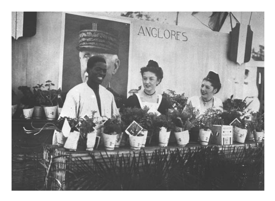
FIGURE 3. Legion Day celebrations in Dakar, n.d.

National Revolution. One of its local presidents defined it as "a national elite, gathered around the warriors, at the command of the Marshal, to take upon itself and to lead the National Revolution until that revolution was realized." 68