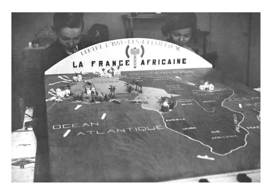
FIGURE 1. A map of Africa presented at the colonies' exposition in Paris, October 1942.

to west from I May until 3I July 194I. One of its main aims was to pass through university towns and enable young people to inquire about career prospects in the colonies. The train included five wagons, each containing an exhibition, as well as a dining and sleeping wagon for the crew. The first wagon was dedicated to the colonial army, the navy, and important figures from the colonial past. The second represented the students of the école coloniale and administrative careers in the colonies. The third contained an exhibition about commerce and agriculture, the fourth concerned the economic value of the empire, and the fifth was dedicated to the Ligue maritime et coloniale (Maritime and Colonial League). In addition, the agency organized charity sales for the benefit of prisoners of war from the empire.<sup>37</sup>